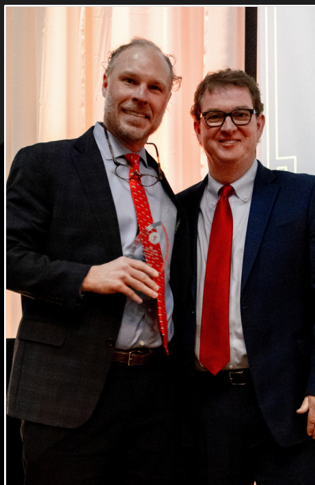
BRAD H. BENTON BUSINESS LEADERSHIP AWARD