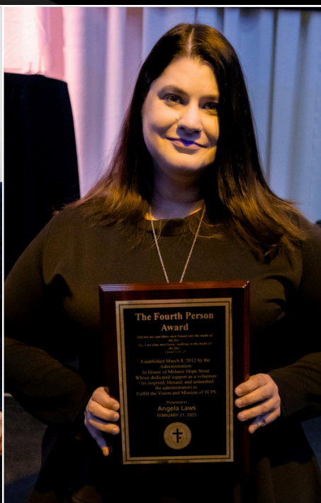
FOURTH PERSON AWARD