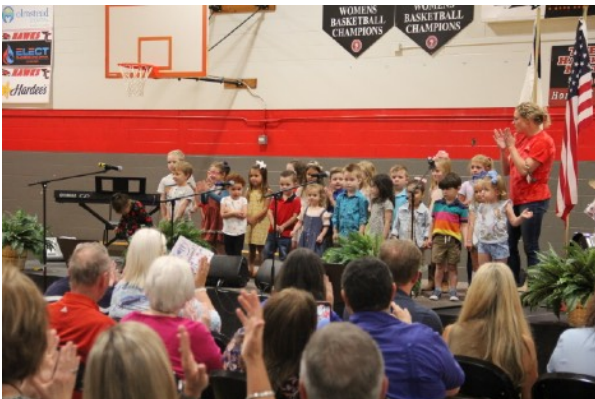
Learning Cottage singing

between generations. We celebrate lessons the generations can teach us if we listen. We can learn through stories, songs, and writings if we make ourselves available to understand. I pray that last Friday allowed for smiles, hugs, and stories from grandparents to children and from children to grandparents.